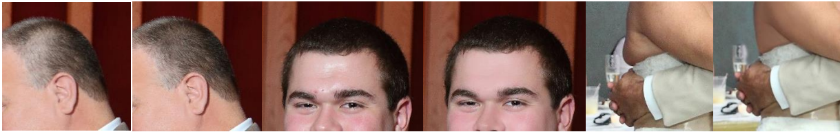
Examples: Hair, Shine, Back / Chin Tucks, Windy Hair, Color Pop > more at www.lbportrait.com/Specialties

• Touchups included – the icing on the cake! I take the time to edit each image top to bottom. I see many photographers skip edits like shiny faces / skin rolls, etc - I don't. I pose / light for best results, then edit for excellence! Color Correction (fixing orange/blue tint) is done so storybook photos flow together seamlessly.