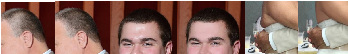
Examples: Hair, Shine, Back / Chin Tucks, Windy Hair, Color Pop > more at www.lbportrait.com/Specialties

• Touchups included – the icing on the cake! I take the time to edit each image top to bottom. I see many photographers skip edits like shiny faces / skin rolls, etc - I don't. I pose / light for best results, then edit for excellence! Color Correction (fixing orange/blue tint) is done so storybook photos flow together seamlessly.